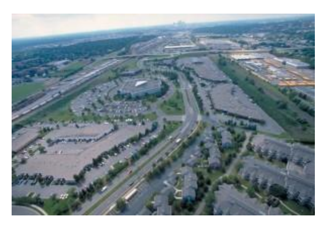
Energy Park – one of the early SPPA acquisitions involved redevelopment of a Superfund site and resulted in attracting/retaining 22 businesses that now employ 4,200 persons.

SPPA currently controls 17 business centers/industrial parks (13 complete and 4 currently under development) in Saint Paul, all of which resulted from acquisition of brownfield sites. Completed projects house 526 businesses that employ over 17,000 persons. The Port Authority ranks TIF as their most frequently used incentive, followed by New Market Tax Credits, revenues derived from past projects, HUD 108, and other federal and state sources. The tools used to implement this successful acquisition-redevelopment program include several distinguishing elements which might be considered by others that might look to replicate the successes: