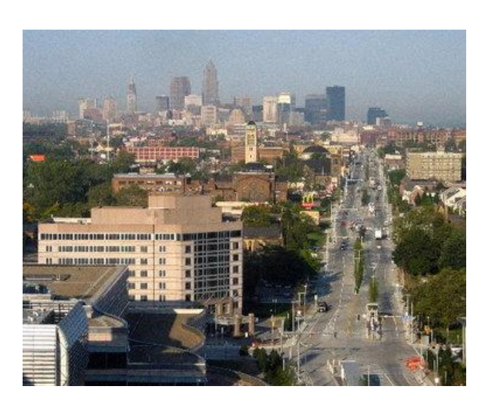
Cleveland's Health Tech Corridor -- strategic Land Bank acquisitions might help lure a data center.

Cleveland Industrial-Commercial Land Bank — The Cleveland Industrial-Commercial Land Bank may be the only current example of a land bank that is geared to re-positioning brownfields and industrial-commercial property. The Land Bank, established in 2005, represents "a proactive approach to reusing properties with serious real estate obstacles, such as environmental contamination and/or economic hardships. This Land Bank provides the opportunity for the City to strategically assemble properties to