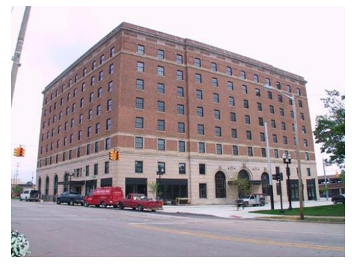
Durant Hotel, now converted to 93 apartments, was rescued by the Genesee County Land Bank.

The land bank has successfully addressed several distressed commercial sites, such as the Durant Hotel (pictured at right), and has been able to re-position them for reuse using TIF, as well as other gap-financing tools. The Land Bank addresses more significant brownfield properties through a collaboration with the Genesee County Brownfield Redevelopment Authority (see discussion of Michigan's Brownfields Redevelopment Authorities, below).