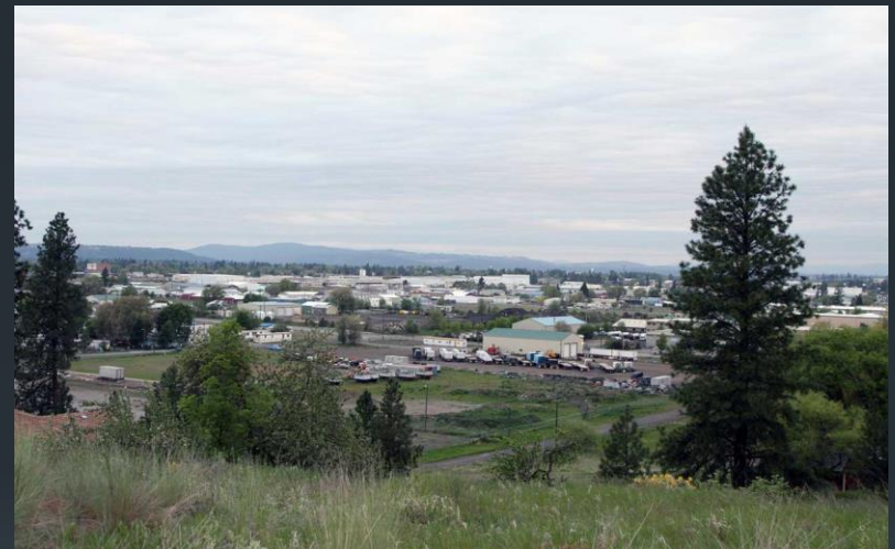
Spokane – first BRA